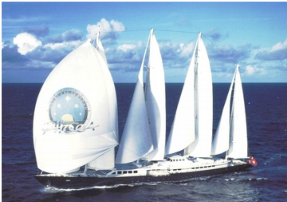
The super-yacht Phocea –long, lean, possibly jinxed, and arrested for almost a year in Vanuatu